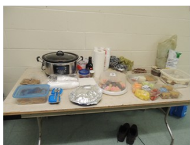
We also have pot-luck-snack-luck table set up for all to enjoy.

December 7 th , 2014 was the date for Saint John Model Flying Club's annual Christmas glider toss and party, this event has been going on for a number of years, and the only rule is that the glider can't be any bigger than to fit into a 12"x12" box, that's it, the rest is up to your imagination. We also have a paper airplane build on site contest that's also very popular, members and guest are all encouraged to participate, as we have lots of extra planes available to whoever needs them.